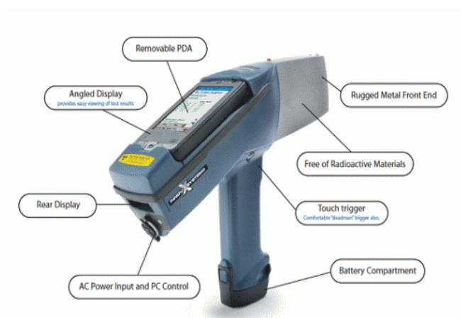
Fig. 1: FP XRF Instrument

Toys, Plastic Lock Covers and FP-XRF Analyzer (Innova-X Analyzer)