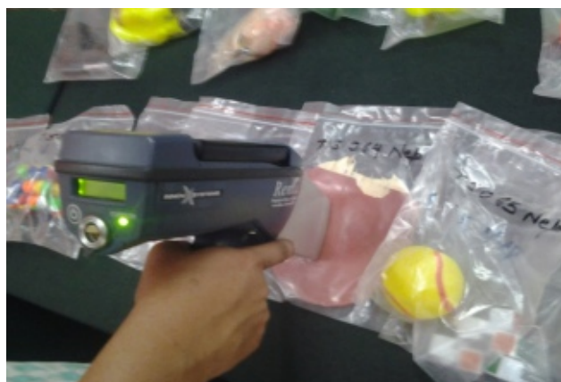
Fig. 3: Detection of Lead Content in Toys