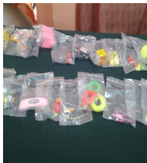
Fig. 2: Samples of Toy

Toys, Plastic Lock Covers and FP-XRF Analyzer (Innova-X Analyzer)